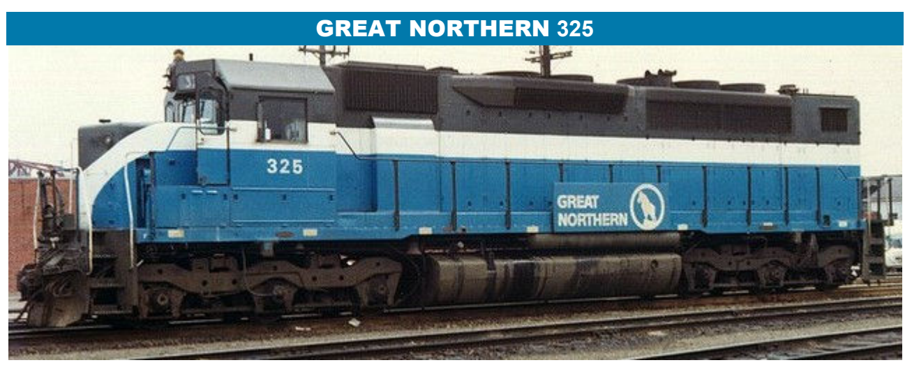
GN SDP40 325 Portland, OR April 1970

Thanks to the generosity of the BNSF Railway, BNSF SDP40 6327 (ex-Great Northern 325) has been donated to the Minnesota Transportation Museum. The Museum would like to return BNSF 6327 to GN 325 painted in the Big Sky Blue paint scheme that it wore during the last years of service on the Great Northern Western Star and International passenger trains. Will you help with this effort? Your contribution will be a great help to bringing back the Big Sky Blue paint scheme to an operating locomotive. Please send your tax-deductible donation for painting locomotive GN 325 to the address below.